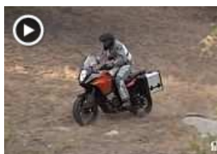
TEN BEST BIKES VIDEO-BEST ADVENTURE BIKE: KTM 1190 Adventure