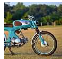
A man built this Honda S90 in his apartment