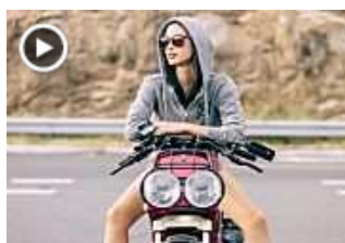
Behind the Scenes From Ruck Out Hawaii VIDEO