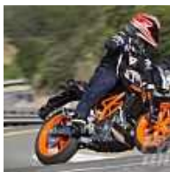
STANDARD/NAKED MOTORCYCLES (Cycle World)

Filed Under: People Tagged With: Arai Helmet , CW Interviews , motorcycle helmets