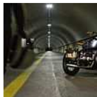
Son Of A Gun: BMW R69S 'Thompson' (Bike EXIF)