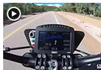
Project 156 Pikes Peak Test Ride POV VIDEO