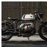
Très Chic: Café Racer Dreams' BMW R100